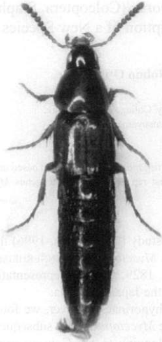
Fig. 1. Mycetoporus japonicus sp. nov.

a little prominent laterally; ocular punctures large and distinct; ocular setae long, robust and located near inner posterior margin of eye, separated from the margin by a distance equal to about half the diameter of puncture. Antennae moderately short, with apex not reaching the posterior margin of pronotum; 1st to 4th segments sparsely setose, 5th to 11th densely and finely pubescent, slightly compressed and gradually increasing in width toward apical segments; relative lengths of antennal segments from base to apex: 14.0:7.5:8.5:6.0:6.5:6.5:6.5:6.5:6.5:10.0; 7th to 10th segments transverse, 1.06, 1.11, 1.15 and 1.23 times as wide as long, respectively. Maxillary palpus with 1st segment small; 2nd and 3rd large, rather widening apicad and sparsely pubescent; last segment conical, 0.7–0.8 times as long as, and about 0.6 times as wide as 3rd, respectively. Labial palpus with last segment narrow, about half as wide as 2nd.